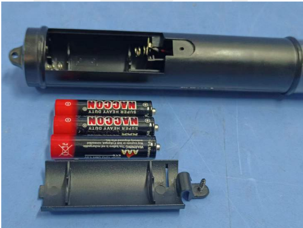
Figure 2: Internal view