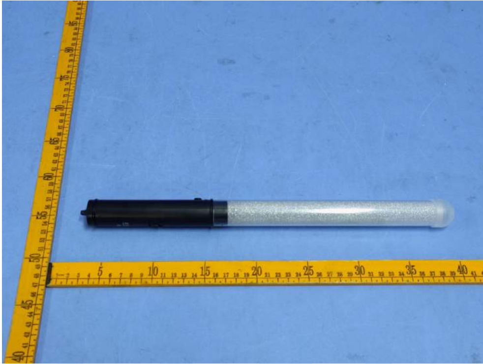
Figure 1: Overall view