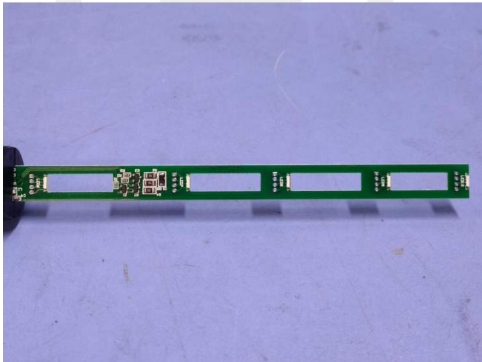
Figure 4: Internal view